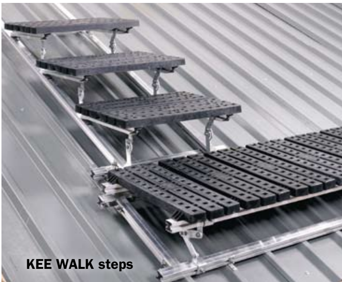
KEE WALK steps

Kee Safety provides pre-assembled step configurations in 3m or 1.5m lengths which require only minor adjustment on-site. The rotating arms (shown above) allow the installer to set the angle of the steps simply by removing the locating bolt, setting the horizontal angle and then replacing the bolt. The steps configurations will change depending on the pitch of the roof. Standard components are available for 5° - 10°, 10° - 15°, 15° - 25°, 25° - 35°, all which comply with the requirements of EN 516. Kee Safety can provide specific information on all the different step configurations as required.