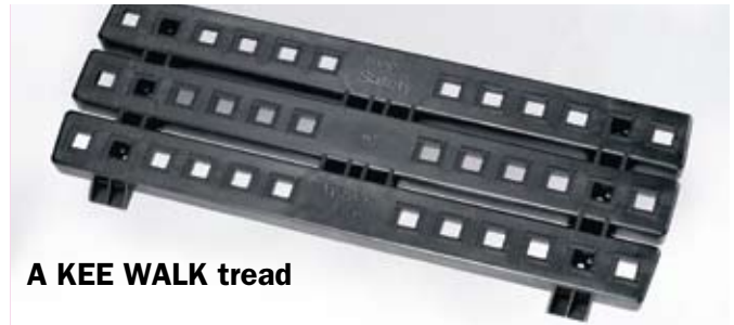
A KEE WALK tread

Manufactured in high grade nylon incorporating raised roughened sections, the treads are developed to comply with EN 516 (Prefabricated Accessories for Roofing – Installations for roof access – Walkways, treads and steps), exceeding the deflection criteria and slip resistance requirements of the standard.