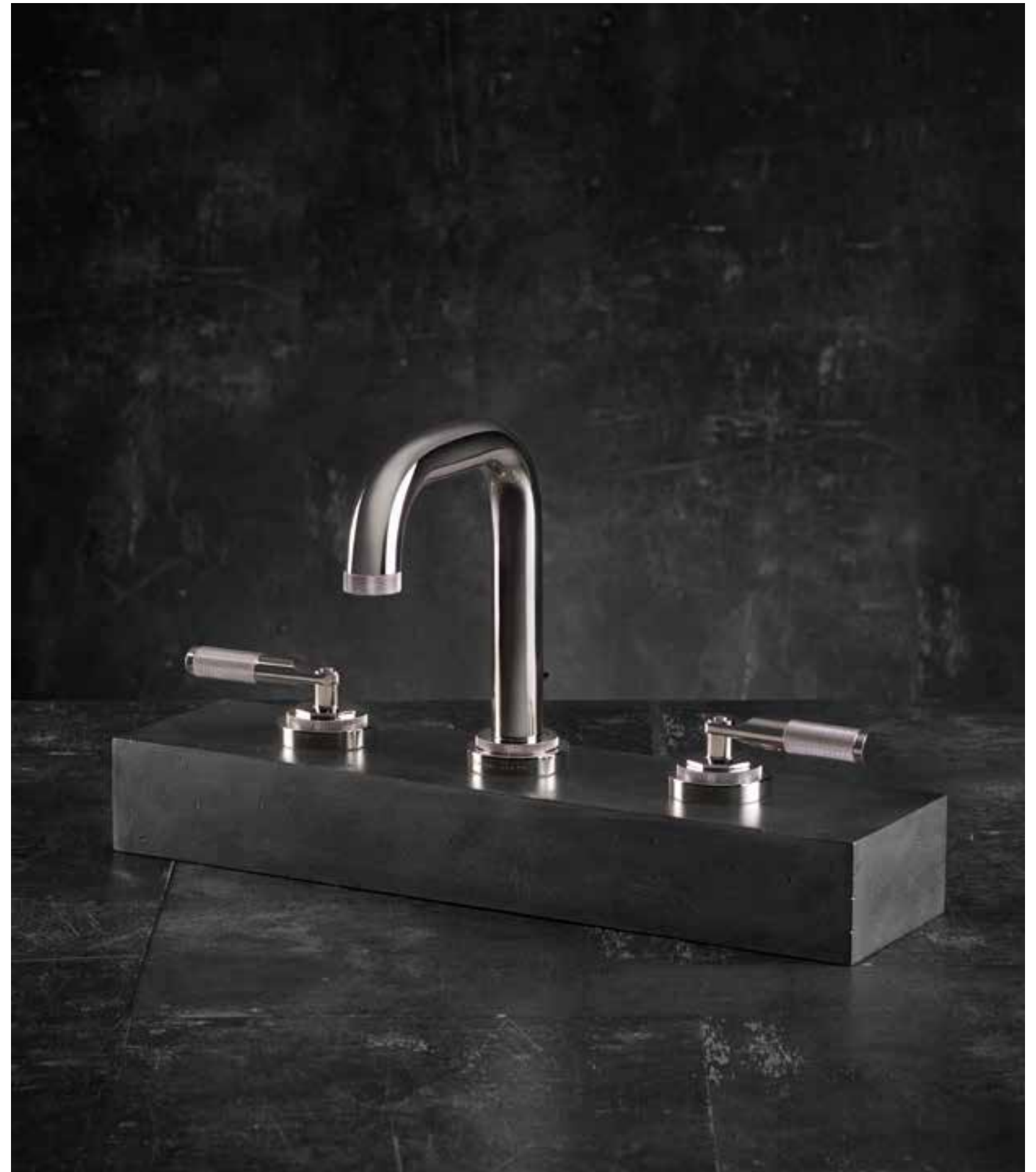
Product 3 Hole Basin Mixer Medium Spout Finish Chrome Plate