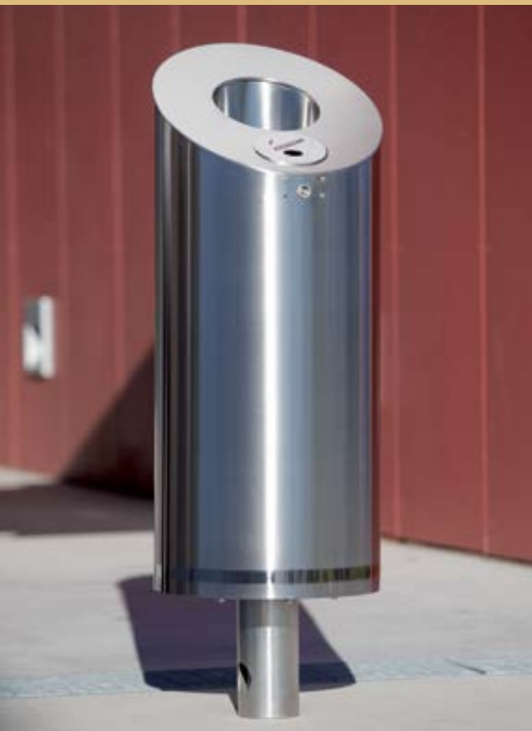
3p-Technology: Stainless steel