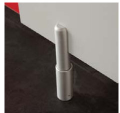
Adjustable Cubicle Leg