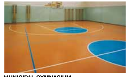
MUNICIPAL GYMNASIUM Lecco - Italy

And the Mapei Research & Development laboratory has developed specific adhesives for this type of application: ULTRABOND ECO VS90, ADESILEX G19 and ADESILEX G20. For laying substrates directly on the ground, a common situation for gyms and school buildings, Mapei also supplies MAPELAY, PVC sheets reinforced with glass fibres. These waterproofing and isolating sheets form the ideal surface for laying sports floors with the adhesives above.