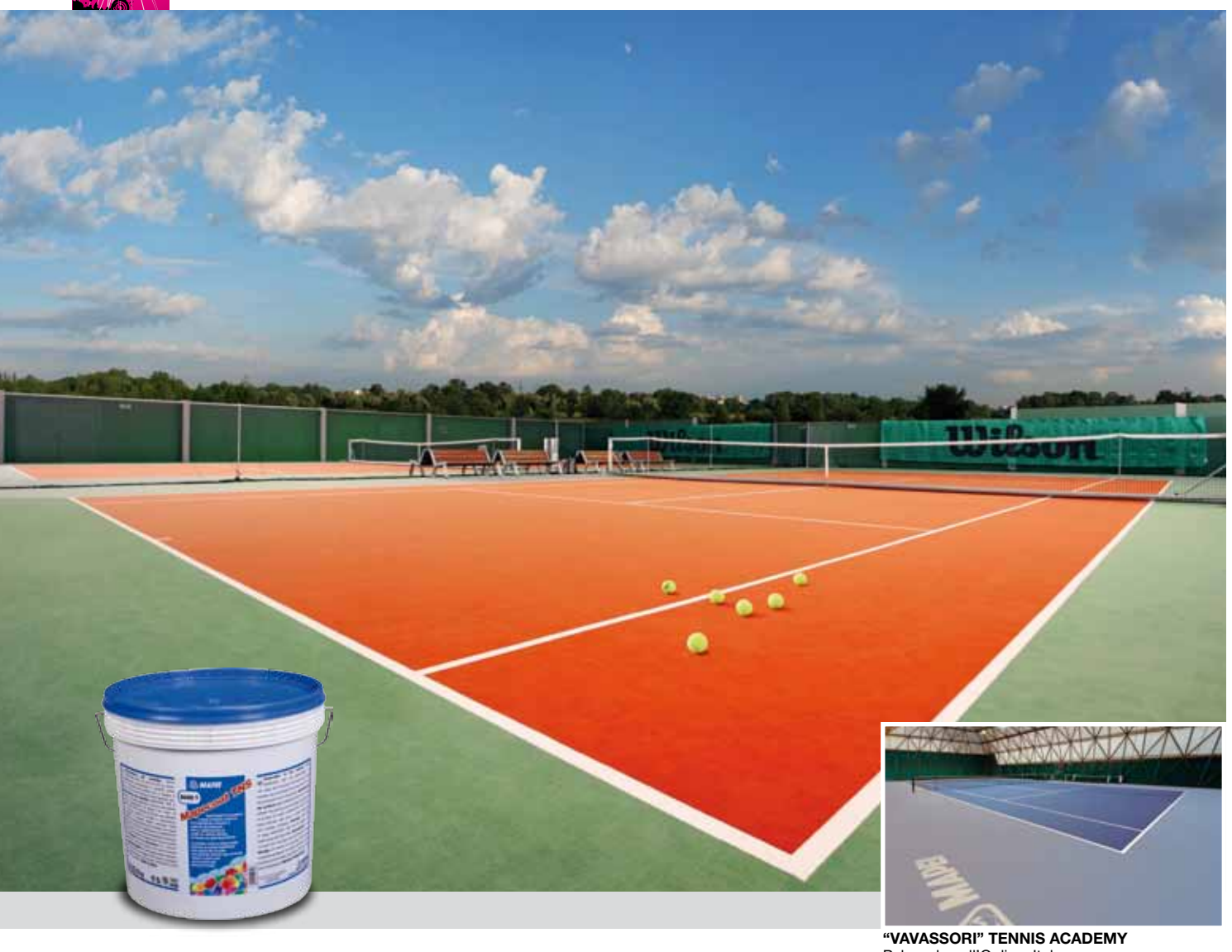
"VAVASSORI" TENNIS ACADEMY Palazzolo sull'Oglio – Italy