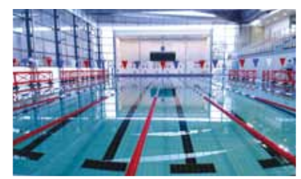
CLISSOLD LEISURE CENTRE London - UK