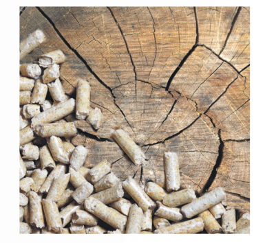
Wood and pellet boilers