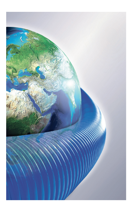
Microflex. Saving energy and preserving the environment