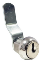
Key Cam Lock