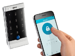
Ojmar OCS Smart Phone Lock