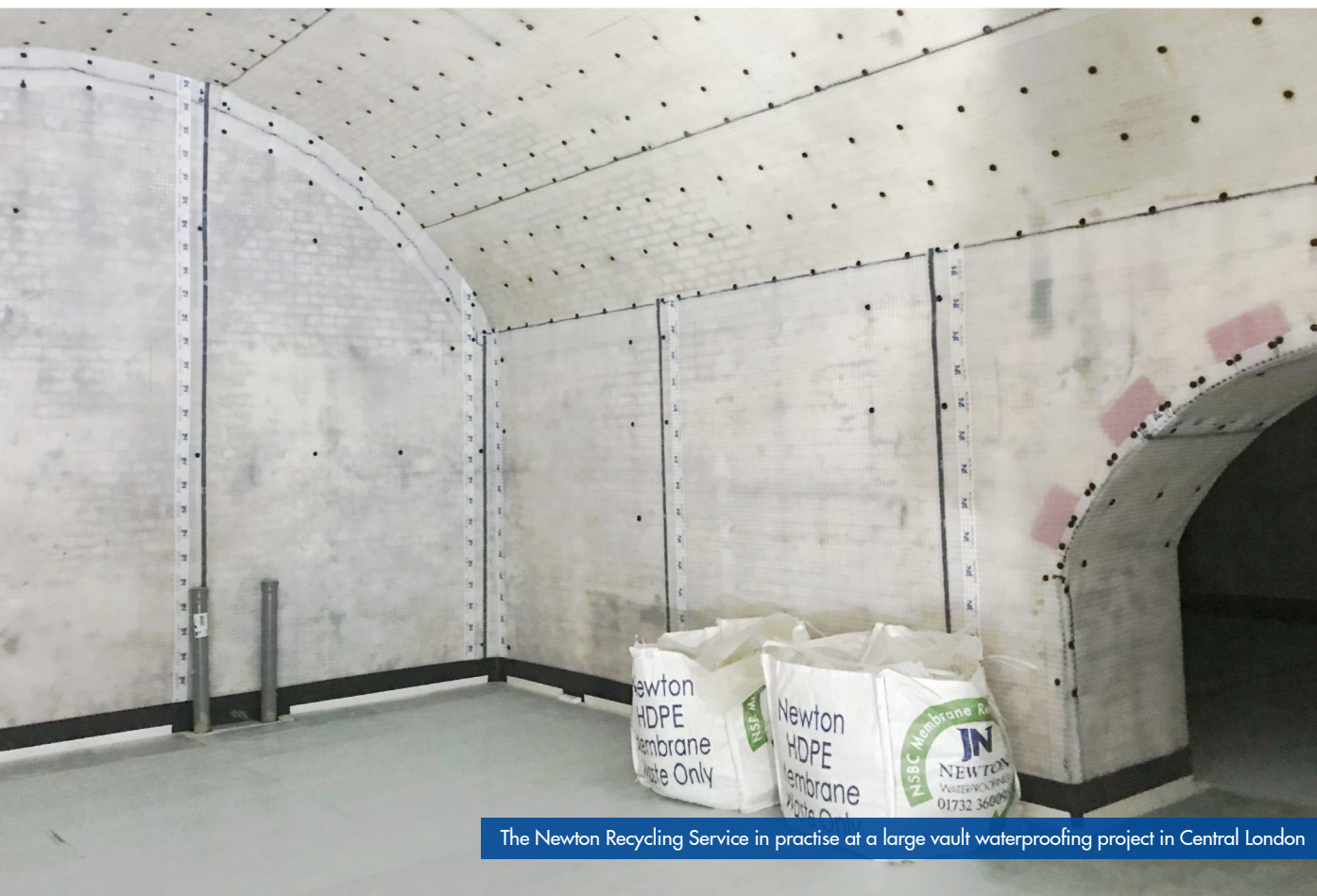
The Newton Recycling Service in practise at a large vault waterproofing project in Central London

WHICH WOULD BE ENOUGH ENERGY TO MAKE 688,234 MUGS OF TEA