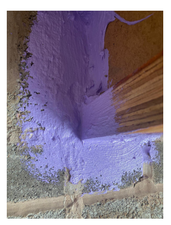
Joist connection on to masonry wall.