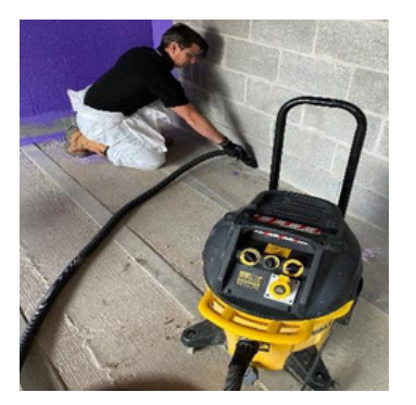
Vacuum all debris.