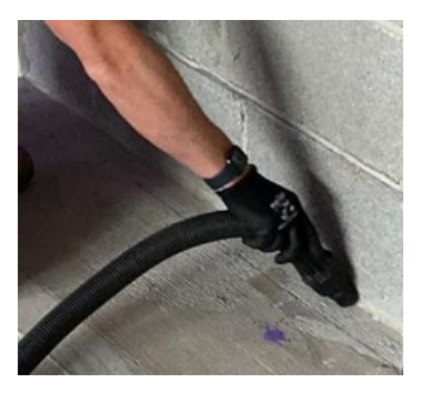
Vacuum all debris.