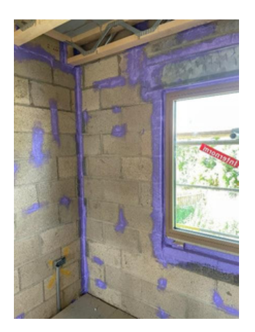
Internal brick connections.