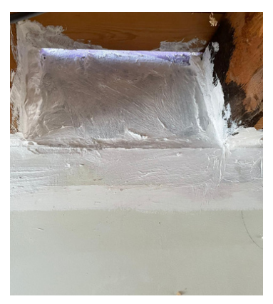
Joist connection in masonry wall using Airtight White Brush.

Passive Purple<sup>®</sup> Brush is a VOC free, polymer-based putty like substance that is applied with a paintbrush and dries to form an airtight flexible coating with excellent adhesion on different substrates. This product is ready-to-use and can be applied in any direction and on any substrate including concrete, masonry, plaster/render, engineered wooden boards, tapes, membranes, aluminum, steel, PVC, PIR Insulation, foams, timber, blockwork.