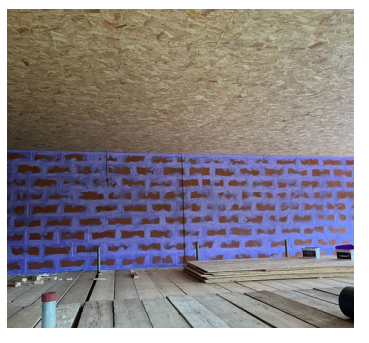
Passive Purple Brush applied to wood fibre.