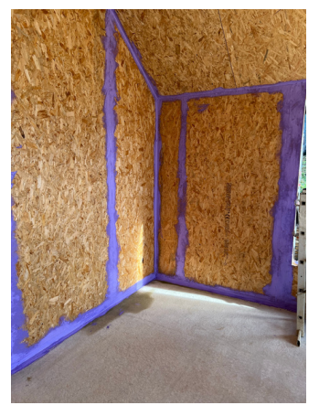
Timber frame connections.