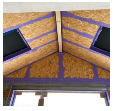
OSB board connections.

Fill gaps bigger than 2mm with Passive Purple® brush. Any gaps greater than 7-10mm, please repair using non-shrink polyurethane foam or mortar.