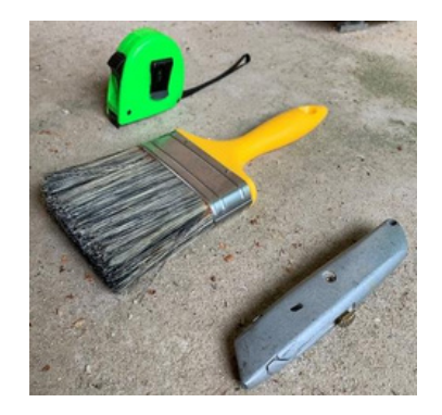
Tools you will need.