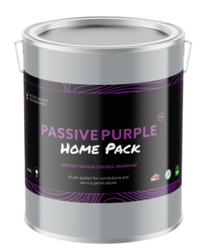
Passive Purple Brush.