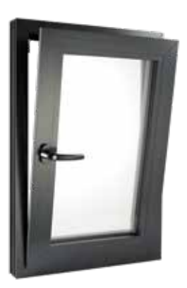
Tilt mode top ventilation position.