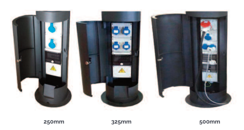
Standard base height 800mm NOT INCLUDING TOP. Available as surface or root mounted.

For more details call 020 8551 8363, email info@popuppower.co.uk or visit www.pupuppower.co.uk