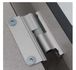
Hidden Safety Hinge