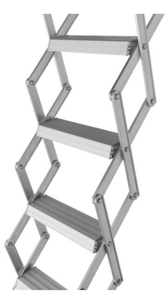
The Piccolo is manufactured from light-weight aluminium profile