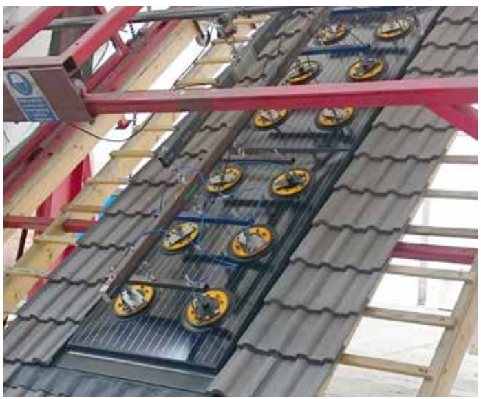
Marley SolarTile® (a Clearline Fusion product) achieved the highest possible wind resistance during testing for MCS012

Systems and system components that are used to install solar panels above an existing pitched roof covering (on-roof systems) do not need to be tested for either weather tightness or external spread of flame, so long as they can demonstrate that the roof covering is not affected by the installation, for example, if the gaps between tiles are increased. By contrast, systems that integrate and replace the roof covering (in-roof systems) are tested for all three aspects.