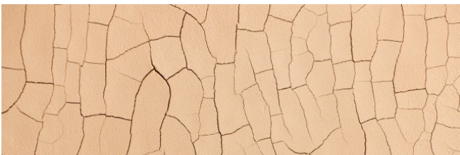
Plaster without PVA

The board has high tile bonding strength however and this can lead to plaster drying too quickly if best practice installation guidance is not followed.