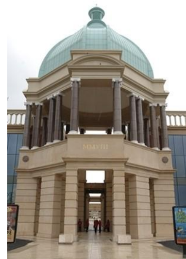
19m dia entablature & dome