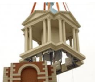
Campanile Belfrey, the size of a detached house lifted to cap the tower at 67m tall. An innovation award winning structure.