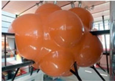
Centre of Cell, QM Medical