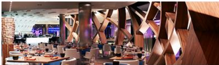
Illuminated 300m2 bar canopy and double curving nest wall, Holland Casino