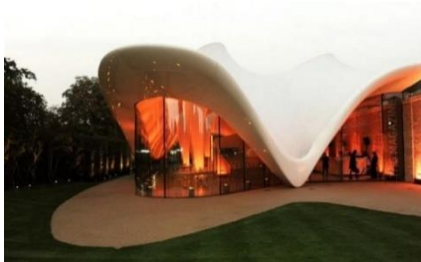
Curving fascia / soffit x 240m2

Balfour Beatty • Populous • Olympic Stadium Transformation spectator pod cladding of 8,500m2. Galliford Try • Zaha Hadid • Serpentine Sackler Gallery Hyde Park London organic perimeter cladding. LOR • HOK • Sir Francis Crick Welcome Trust new medical research facility 840m2 organic pod. Galliford Try • Stanton Williams • The Mailbox Birmingham portal frames 11.5m wide x 94 No. In addition we are working on simulation projects for clients and sites worldwide.