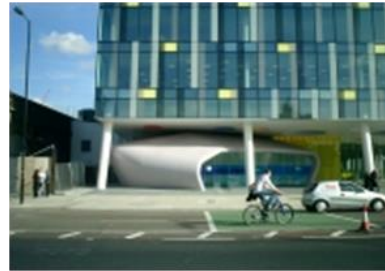
TFL – Palestra pod