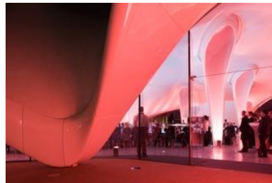
Ditto, plus column linings x 5