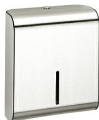
PAPER TOWEL DISPENSER: XINX600