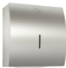
PAPER TOWEL DISPENSER: STRX600