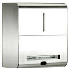
PAPER TOWEL DISPENSER: XINX630