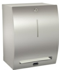
PAPER TOWEL DISPENSER: STRX630