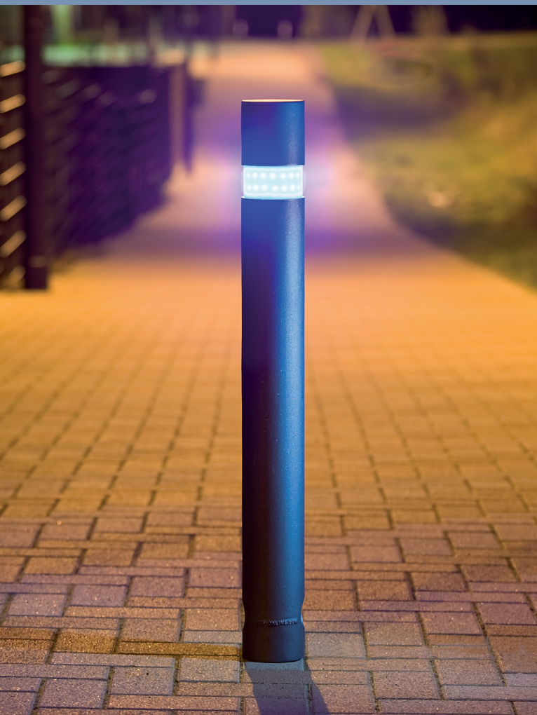
Colour: DB 703