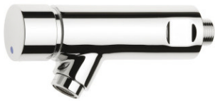
SELF-CLOSING BIB TAP: AQUA205W