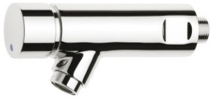
SELF-CLOSING BIB TAP: AQUA205W