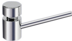
TABLE SOAP DISPENSER: SD80