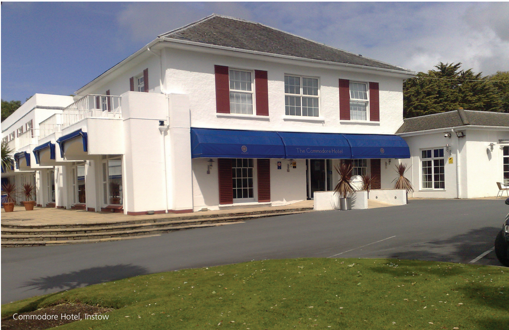
Commodore Hotel, Tinstow