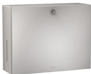
COMBINATION PAPER TOWEL, SOAP DISPENSER: RODX601