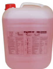
LIQUID SOAP: SO10L