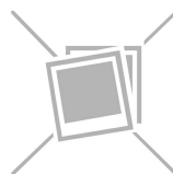
PAPER TOWELS: FH68