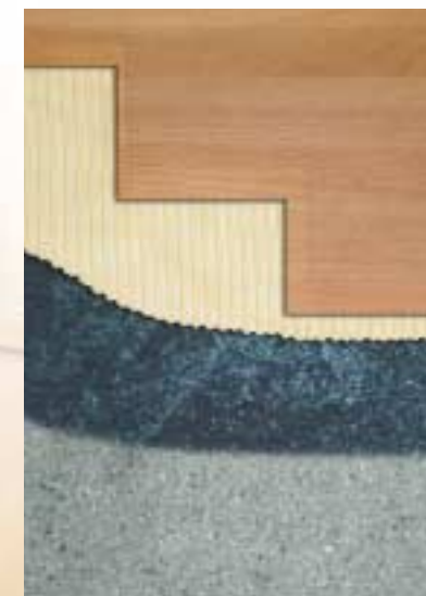
SikaPrimer MB can only be used together with SikaBond adhesive systems