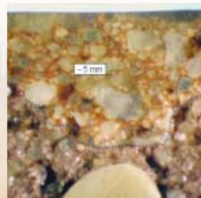
SikaPrimer MB penetration