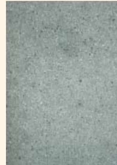
The substrate is too humid and there is time pressure ...

In Renovation as well as new Construction there is always the Question of Substrate Quality.