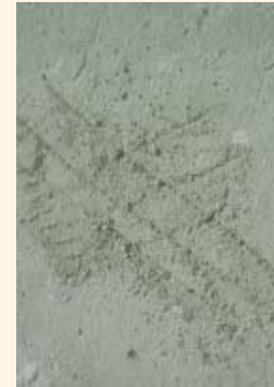
The substrate is not strong enough ...