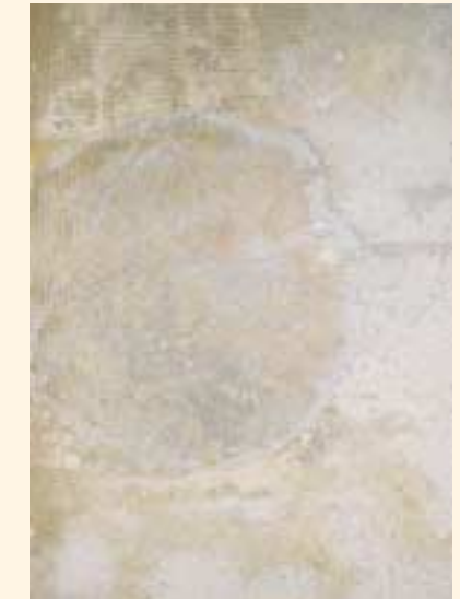
Unsure about old adhesive residues or asphalt-based substrates ...