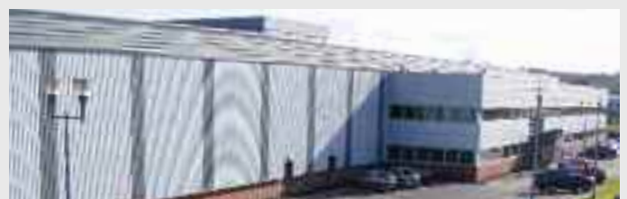
Spectraplan factory, Chesterfield