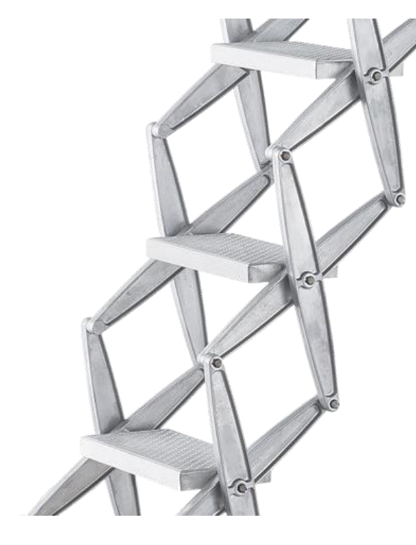
Supreme Vertical aluminium loft ladder with large steps for comfort and safety

Pressure die-cast aluminium Spring-assisted retractable ladder 200kg per step 0.58 W/m<sup>2</sup>K 3.39m Compliant to EN 14975 (DN 4570) 2-year full warranty and 10-year parts warranty