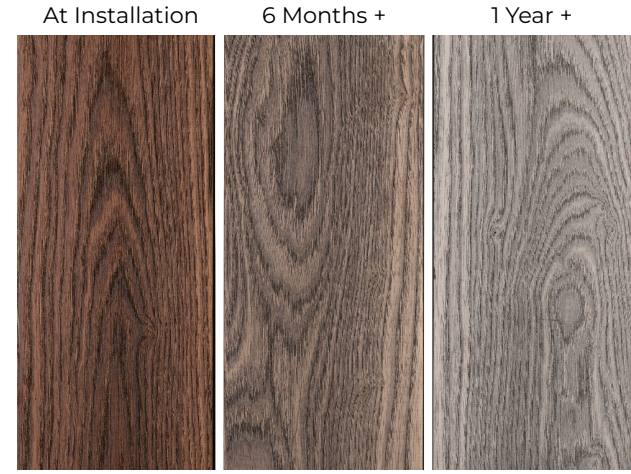
Ageing scale depending on maintenance & exposure