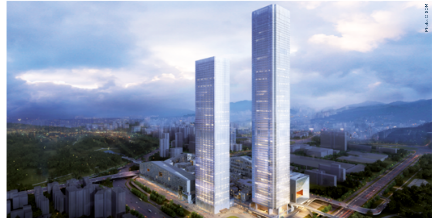
• SHUM YIP UpperHills LOFT, Shenzhen, China