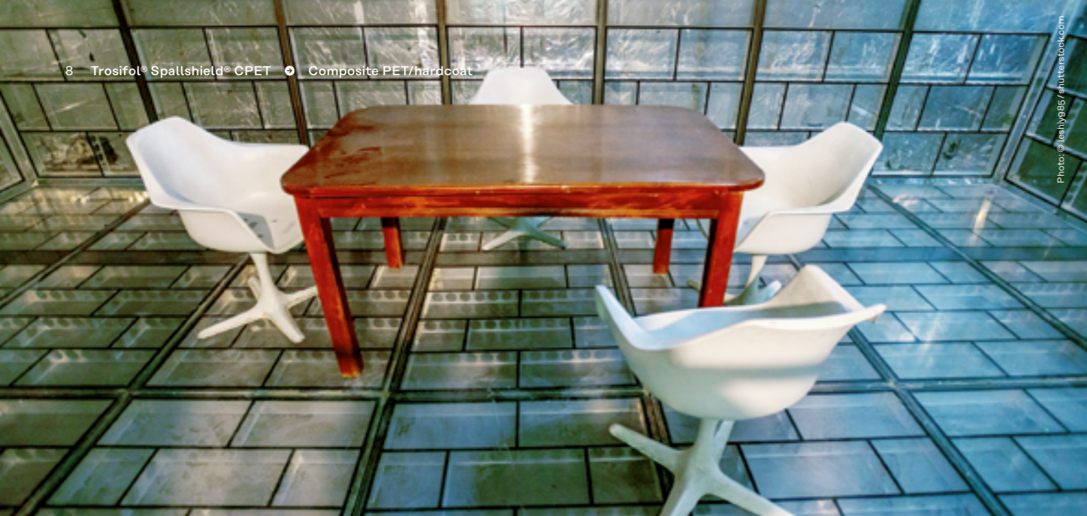
• Glass room in former US Embassy