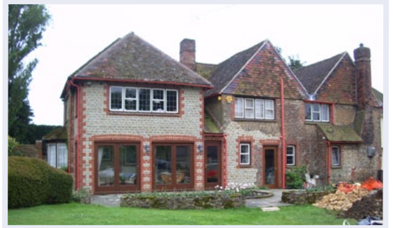
The owners of this stylish property wanted more space and created a new basement

The NSBC installed Newton System 500 with no minimal surface preparation and in a timely manner without the need for extensive drying out times as with other internal tanking systems. The system was installed with service entry points into the drainage channel to enable maintenance of the system - a new design requirement under BS8102:2009.