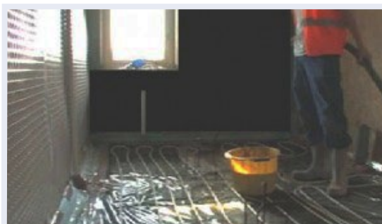
Application of Newton 508 cavity drain membrane to the walls