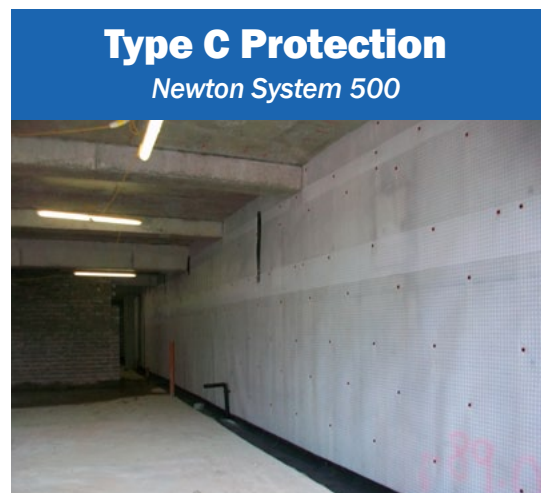
Newton 508 BBA Approved Cavity Drain Membrane

Other waterproofing requirements such as protection at podium decks, pile caps etc. can be successfully waterproofed using Newton waterproofing systems, often using a combination of systems and products.