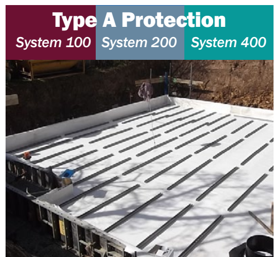
Newton 403 Hydrobond Bonding Membrane for Raft and Wall Waterproofing