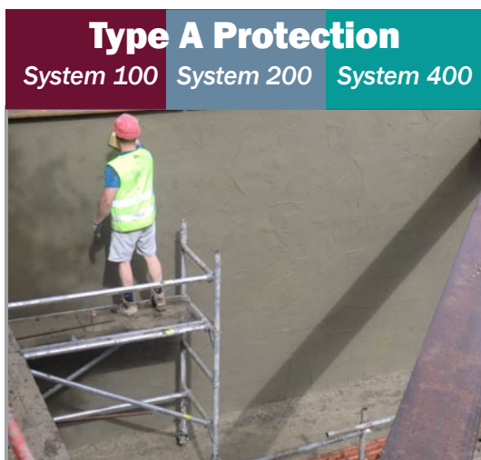
Newton 101F Cementitious Flexible Waterproofing Membrane

Newton 403 HydroBond is pre-applied to the blinding ready for the forming of the concrete raft and the shuttering (permanent or temporary) for the forming of the walls. The product has a fleece inner surface that the wet concrete absorbs into so that when cured, a permanent mechanical bond is formed. This means that if a defect were to occur in the membrane surface, water can only enter at the defect and is unable to move to the joints and so cannot pass into the structure. If the defect happens to be at a joint, water can still not enter the joint due to the solid uPVC waterbar, Newton 310 eFlex , which is also applied to the shuttering or blinding and also fully bonded to the concrete. In addition, Newton 403 HydroBond has a layer of a hydrophilic polymer that swells when in contact with moisture and so will quickly and permanently seal defects in the membrane. The combination of the self healing and bonded properties makes Newton 403 HydroBond a very safe option where Type A membranes are required. Used in conjunction with the Newton System 300 injectable waterbars, it is possible to include design considerations for all of the warnings cited in the previous page within a Type A plus Type B combined waterproofing system.