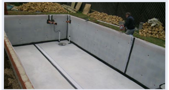
Newton 508 cavity drain membrane was applied to the walls