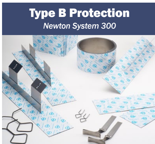
Newton 301 AquaProof, our unique coated metal construction joint water bar