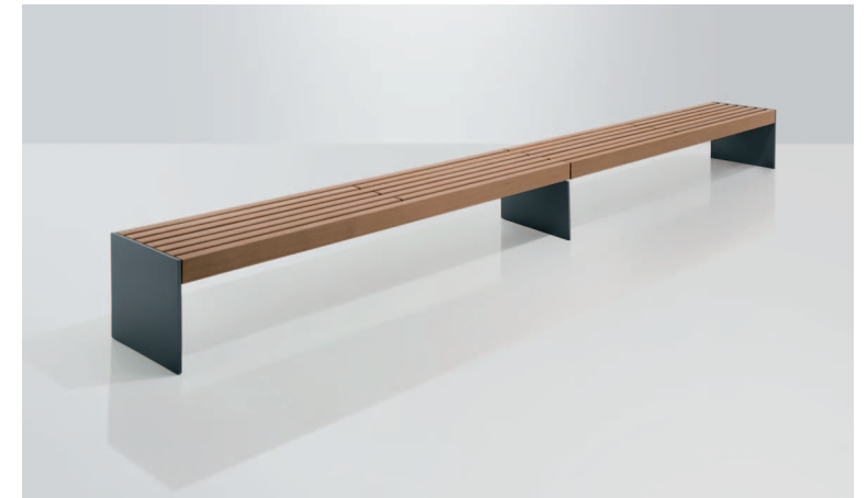
BE WEI F 320 F60 XX 50

The middle leg is shorter to fit underneath the slats.