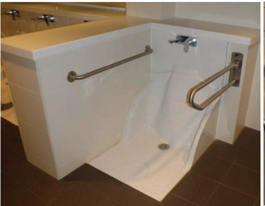
WM MODULAR WITH GRAB BARS AND ROOM FOR WHEELCHAIR ACCESS

The WuduMate Modular Disabled is specifically designed to be installed without a seat enabling wheelchairs to be wheeled onto the unit, with grab bars being provided for support, and taps with wrist blades or sensors for ease of use for arthritic users.