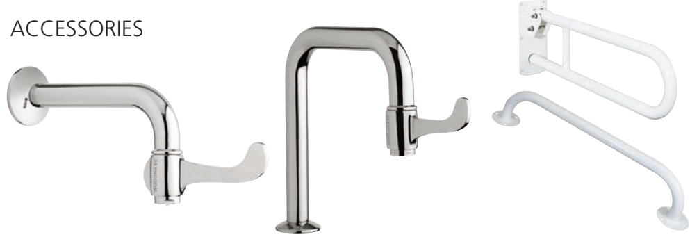
TAPS WITH WRIST BLADES