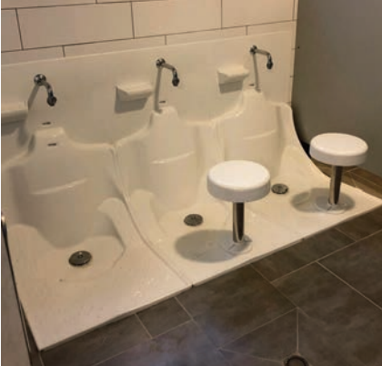
WM MODULAR SHOWING A DISABLED UNIT FOR WHEELCHAIR ACCESS