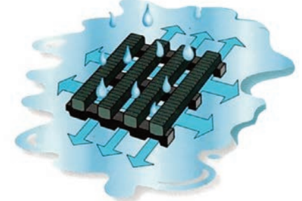
Instant 4 way drainage