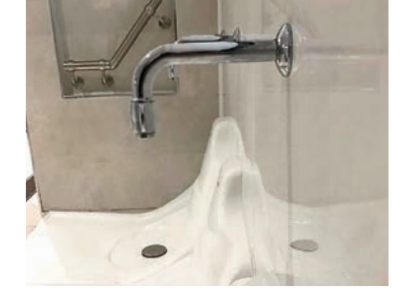
GRAB RAIL FOR DISABLED MODULAR INSET INTO A WALL TO INCREASE SPACE