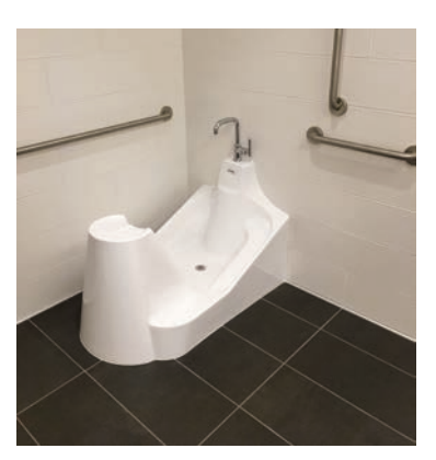
WM CLASSIC WITH GRAB BARS AND ROOM FOR WHEELCHAIR ACCESS

The WuduMate Classic relies on wheelchair users dismounting from the wheelchair to the WuduMate as one would a DOC M toilet, with grab bars being provided for support, and taps with wrist blades or sensors for ease of use for arthritic users.