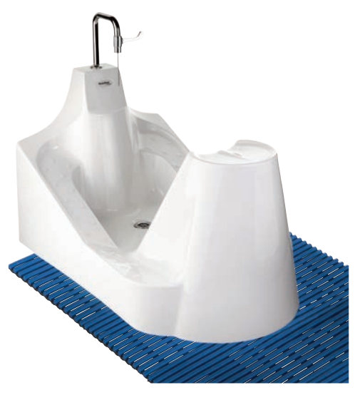
WUDUMATE CLASSIC WITH NON-SLIP SHAPED MAT