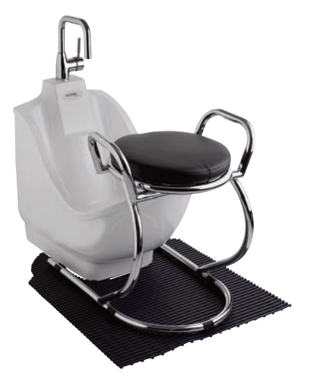
WUDUMATE COMPACT WITH NON-SLIP SHAPED MAT