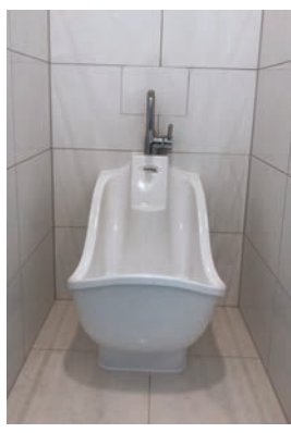
WM COMPACT WITH STOOL REMOVED FOR WHEELCHAIR ACCESS