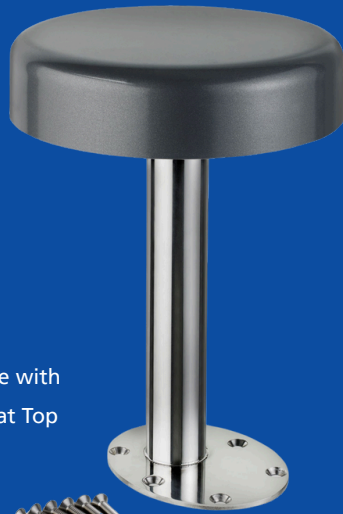
Seat Pole with Grey Seat Top