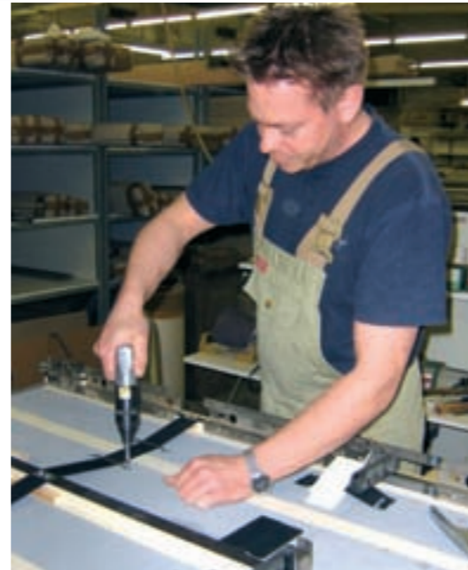
Versiplan Production, Becker GmbH