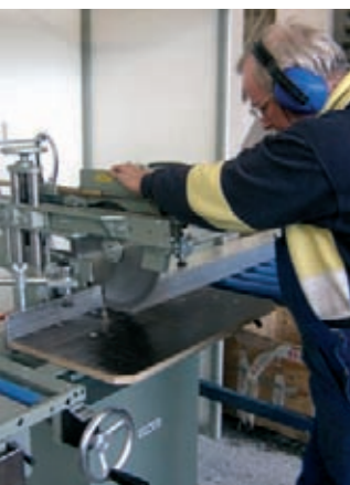
Cutting Monoplan Track