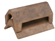
Gas flue ridge unit