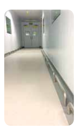
Corridors & Stairwells