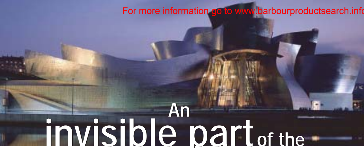
CHRISTIAN RICHTERS FOTOGRAF