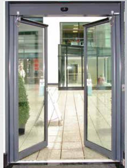
Powerful but silent opening and closing with a long-lasting, maintenance-free motor.