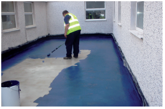
Application of Newton 902 Primer to prevent outgasing from the new concrete