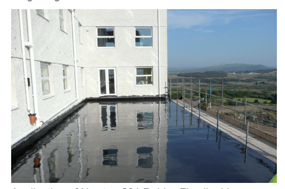
Application of Newton 201 RubberFlex liquid waterproofing membrane