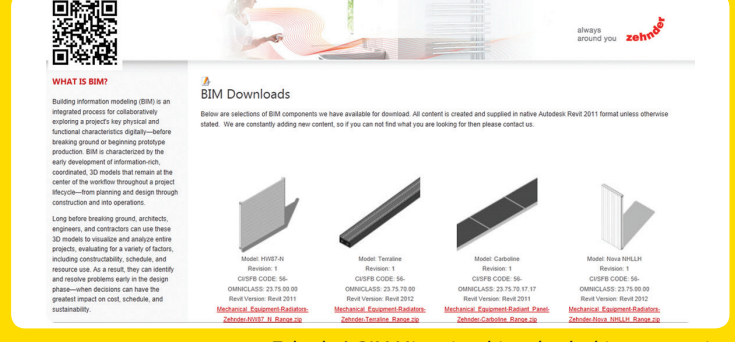
Zehnder's BIM Microsite, driven by the bimstore engine

Components Zehnder are not BIM experts, they manufacture high quality radiators. They asked our team at bimstore.co.uk to create their content for them. From sign off to component library (52,683 products in 15 families) took just three weeks. We think that represents the real value.