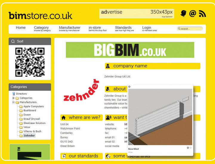
Zehnder products hosted on bimstore.co.uk