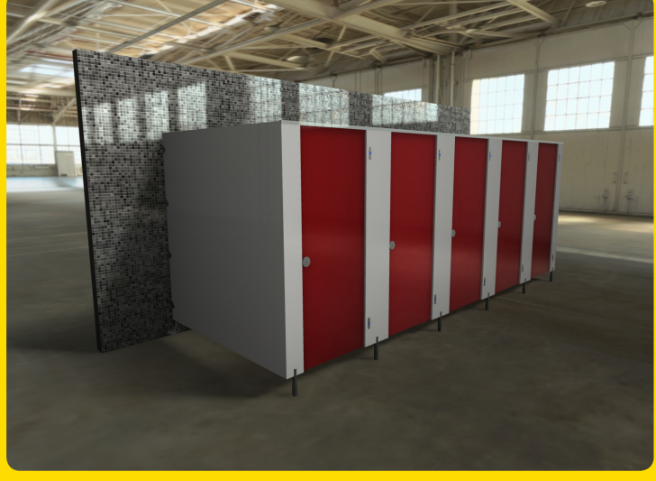
Cubicle Centre products hosted on bimstore.co.uk