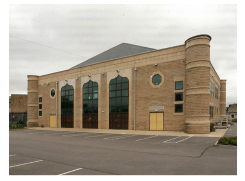
Non-standard stone units to complement natural stone walling to clients specification. Non-standard units individually designed in conjunction with client and architect.