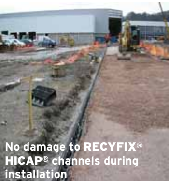
No damage to RECYFIX® HICAP® channels during installation