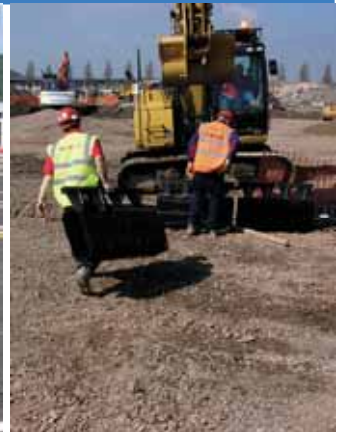
Five RECYFIX® HICAP® sizes weigh less than 25kg

Hauraton RECYFIX® HICAP® high capacity drainage channels can be arranged act as an efficient storm-water retention system. The channel components are made from the company's tough 100% recycled Polyethylene-Polypropylene (PE-PP) and available in six retention capacities from 18.4 to 433 litres. All channels are factory fitted with ductile iron slotted inlets available in four configurations. The ductile iron is finished in a Black anti-oxidisation coating. All but the largest sizes weigh less than 25kg and so complied with manual lift regulations. The largest 443 litre capacity channel weighs 31 kg. Channel runs can be configured using one channel size or units can be linked in a cascading design with the run having a progressively larger capacity.