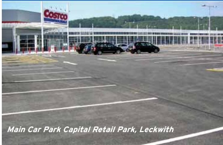
Main Car Park Capital Retail Park, Leckwith