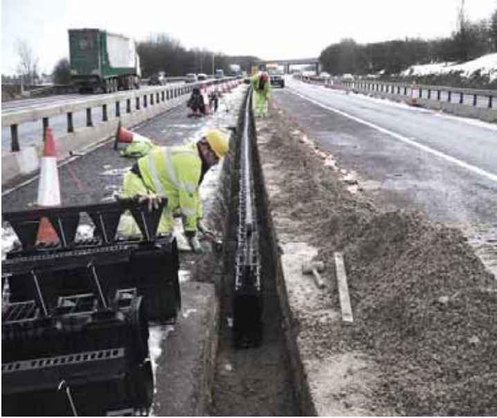
One man lift enables easy positioning of the RECYFIX® HICAP®

Just over 300 metres of RECYFIX® HICAP® have been installed by M.J. Church Limited between Junction 14 and 15 on the M4. The HICAP® system is the result of an extensive Research and Development programme, where our design engineers identified the potential of using recycled PE-PP materials for high volume drainage channels. This allows specifiers and contractors flexibility in heavy duty drainage schemes coupled with trouble free installation, especially where tarmac is the surrounding surface. This design work resulted in an innovative surface water drainage system that has the potential of reducing the number of channel runs normally required to drain a given area. Field experience has shown this reduction has meant less underground excavations, materials and vastly reduced installation times. Unlike similar "heavy duty" drainage systems on the UK market that use galvanised steel slots, the inlets on our HICAP® channels are made from strong ductile iron, so accidental distortion during installation has proved not to be a problem.