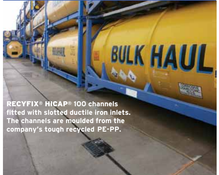
RECYFIX® HICAP® 100 channels fitted with slotted ductile iron inlets. The channels are moulded from the company's tough recycled PE-PP.