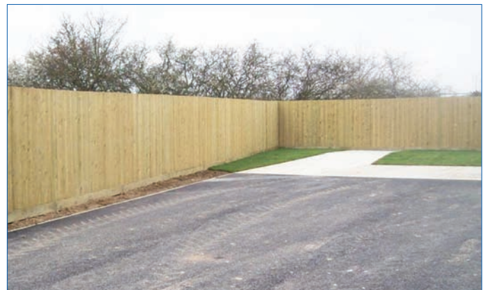
Featherboard fencing creates a strong perimeter line

Given the scale of the investment made by the council in developing the site and the potential controversy it might attract, two critical factors remained top of mind throughout the build. Firstly, the completed project must blend with the local landscape and offer an aesthetically pleasing solution to the housing needs of the traveller community. Secondly, any money spent must be proven to represent a value for money, long-term investment. On both counts, the decision to work with Jacksons made it easy to meet both criteria. Inspirational design and a high quality build are the cornerstone of Jacksons success and this combined with the company's unique 25-year guarantees across both timber and steel products (resulting in an unparalleled lowest lifetime cost), ensured that the standard of physical security works completed at Severalls Lane, met with both the council and local community's approval.