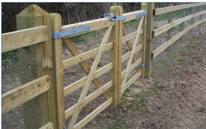
Post and Rail fencing clad with wire netting and double Uni-gates