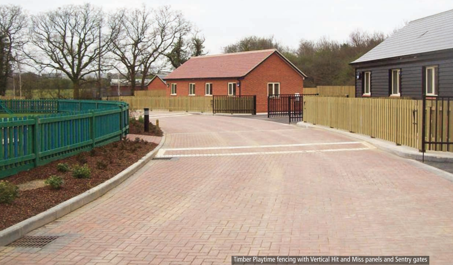
Timber Playtime fencing with Vertical Hit and Miss panels and Sentry gates