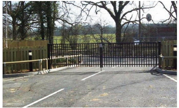
Sentry gate with Diamond Rail and Hit and Miss fencing

Verge protection marker posts were incorporated into the design of the development, to encourage a responsible approach towards the maintenance of any grassed areas and to discourage reckless parking or driving. Each verge protection marker post is equipped with two high visibility reflectors which provide additional safety lighting during periods of diminishing daylight. Attractive but inherently strong Diamond Rail fencing featuring a bird's mouth top and galvanized strap, which further reduces the risk of damage to fencing or grassed areas from cars which might mount the kerb within the site's main turn around area.