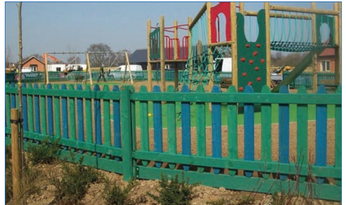
RoSPA approved Timber Playtime fencing

Each of the twelve plots is given its own discreet territory divided by Vertical Hit and Miss 'good both sides' fencing which delivers an agreeable view of the fence line for both the residing family and its neighbours. Every dwelling features a secure entrance point courtesy of the Sentry gates on each plot. To encourage a community feel to the development, each home is also provided with an individual galvanized mailbox mounted onto a timber frame.