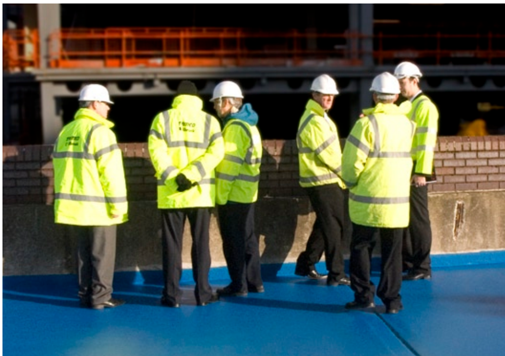
Above: Visitors inspect the roof deck during the Project Open Day. Delegates attended a technical seminar, site inspection and a live demonstration of the coating system