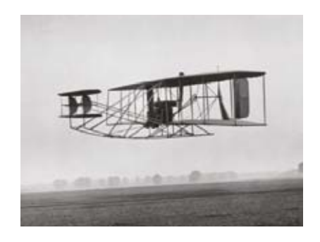
13 December 1903: The Wright brothers make their first flight.