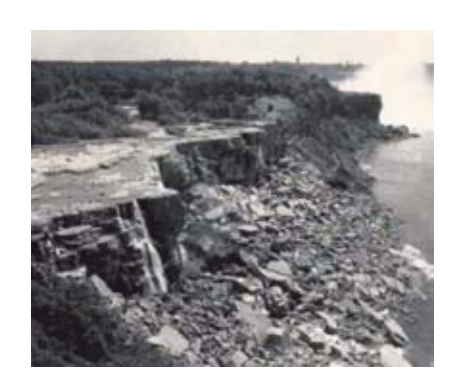
22 March 1903: Niagra Falls runs out of water because of a drought.