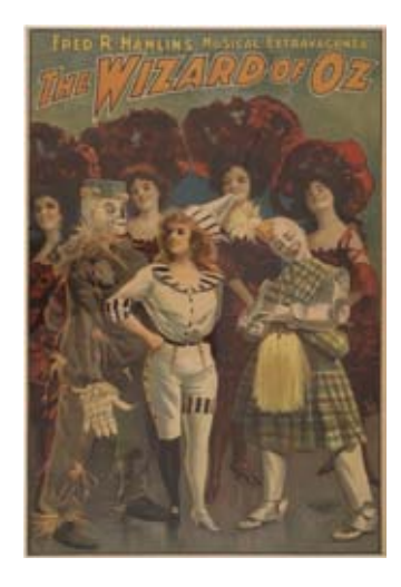
21 January 1903: The Wizard Of Oz premieres in New York City.