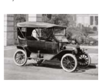
16 June 1903: Ford Motors incorporates.