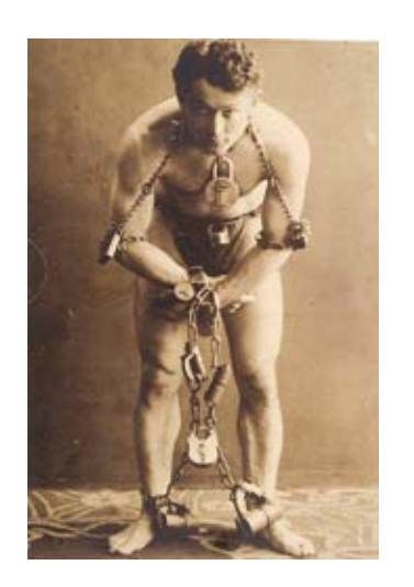
21 January 1903: Harry Houdini escapes from a police station in Amsterdam.