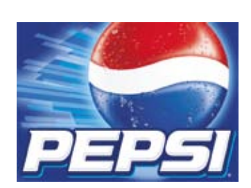
16 June 1903: Pepsi Cola company forms.