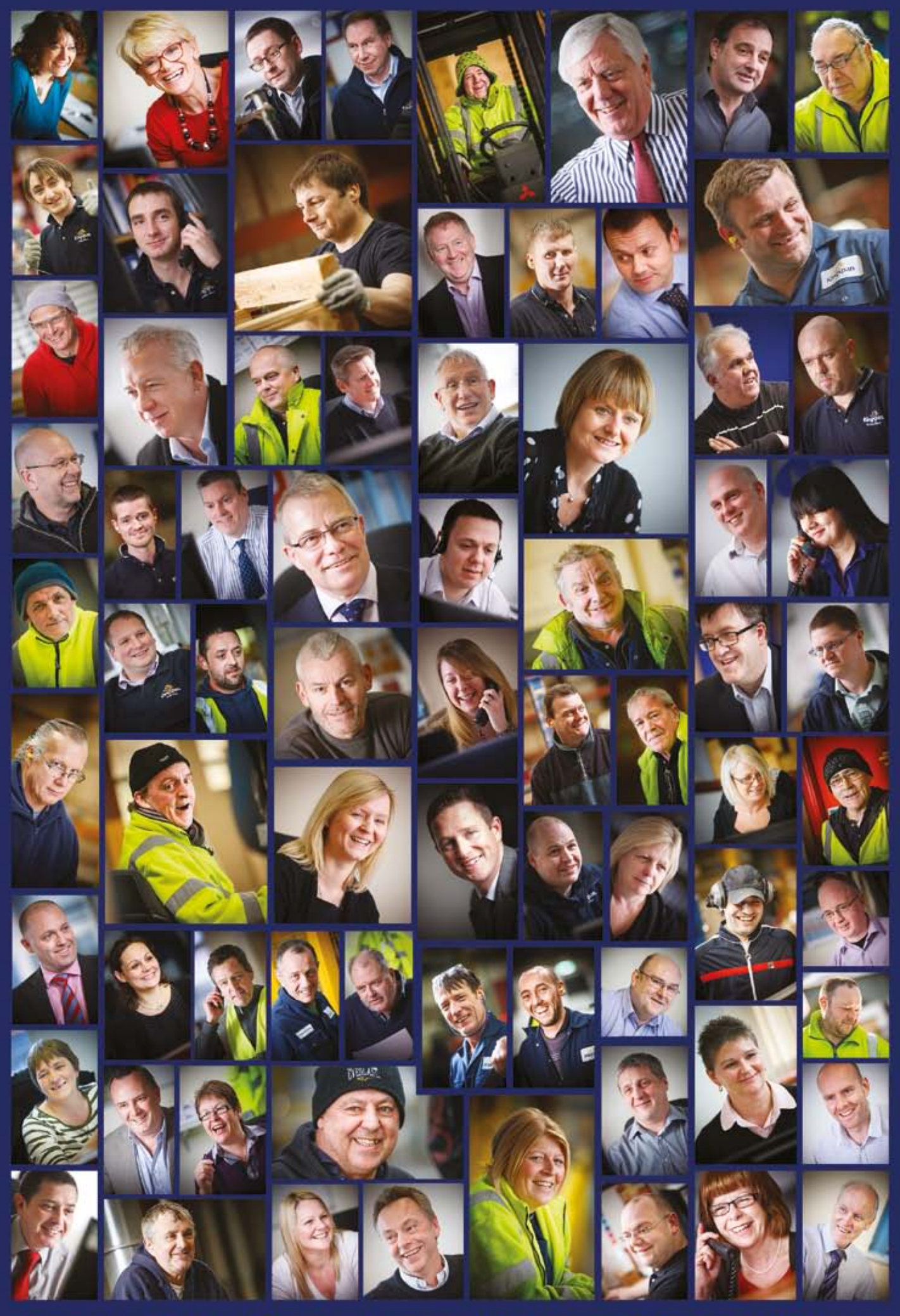
Kingspan Access Floors - the people who raise your expectations.