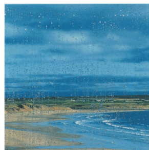
Ordinary float glass

Finally, in the spring of 2001, Pilkington Activ™, the world's first solar-powered self-cleaning glass, came to light. The product uses UV energy from the sun to keep windows clean naturally, by a two-step process. The coating's photoactivity breaks down organic materials, reducing the adherence of dirt to surfaces. The coating's hydrophilic action then helps wash off the dirt during rain.