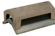
Gas flue ridge unit