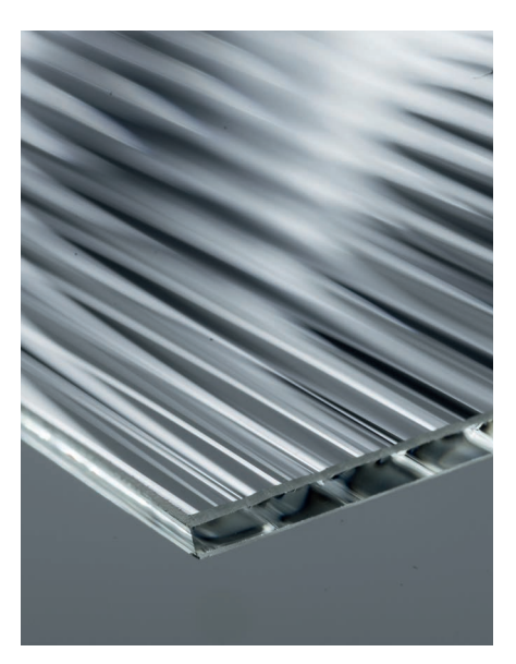
The fine structured decorative glass SCHOTT RIVULETTA® opens up new design possibilities.

Straight and purist in form, elegant in its look and feel: thin, parallel flutes running along one side give SCHOTT RIVULETTA® its timeless, classical beauty. A design which is wholly created from the material itself. In contrast to it, the flat back side that underscores the brilliance of its overall impression with its likewise fire-polished surface.