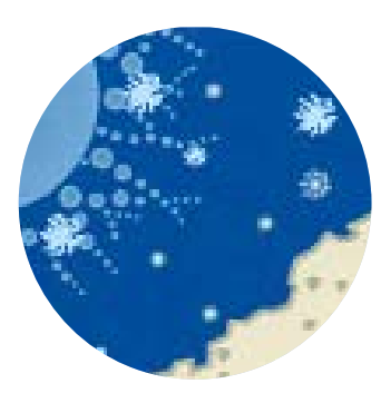
Conventional concrete when hydration is complete.