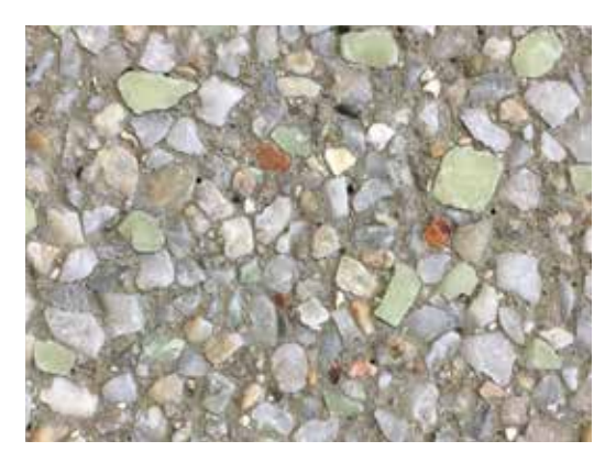
Example of Victorian Grey Toptint with Glow+ jade chippings.

Example of Wheat Toptint with Glow white and Glow light grey chippings.